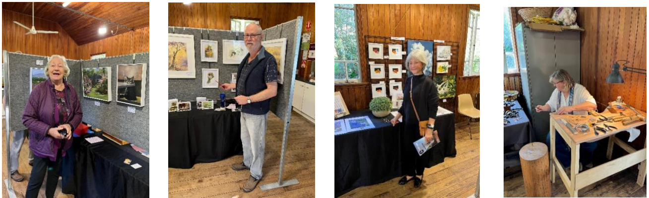
Just a few images from the 8 th Trails. Many more were posted on our Facebook page and the Samford and Surrounds Art Trails Facebook page.